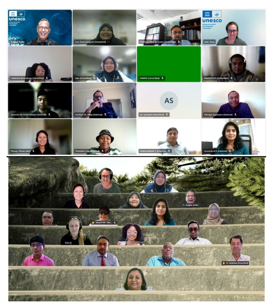
Figure 1: Participants at the intersessional meeting of ICG/IOTWMS Working Group 3, 21 August 2024.