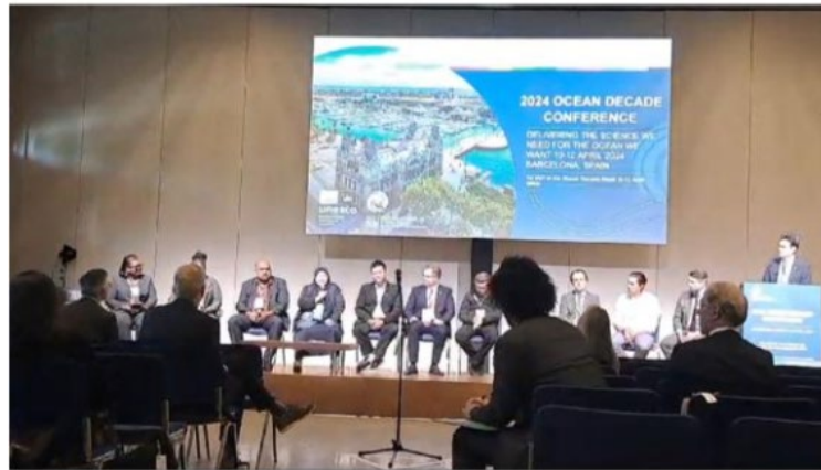
Ocean Decade Conference, Barcelona, April 2024