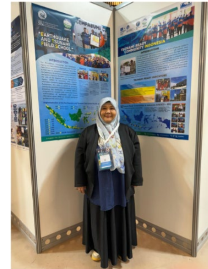
Poster Session on the Ocean Decade Conference, Barcelona, April 2024

ICG/IOTWMS Intersessional Meeting of Working Group 3 on Tsunami Ready Implementation, 21 August 2024