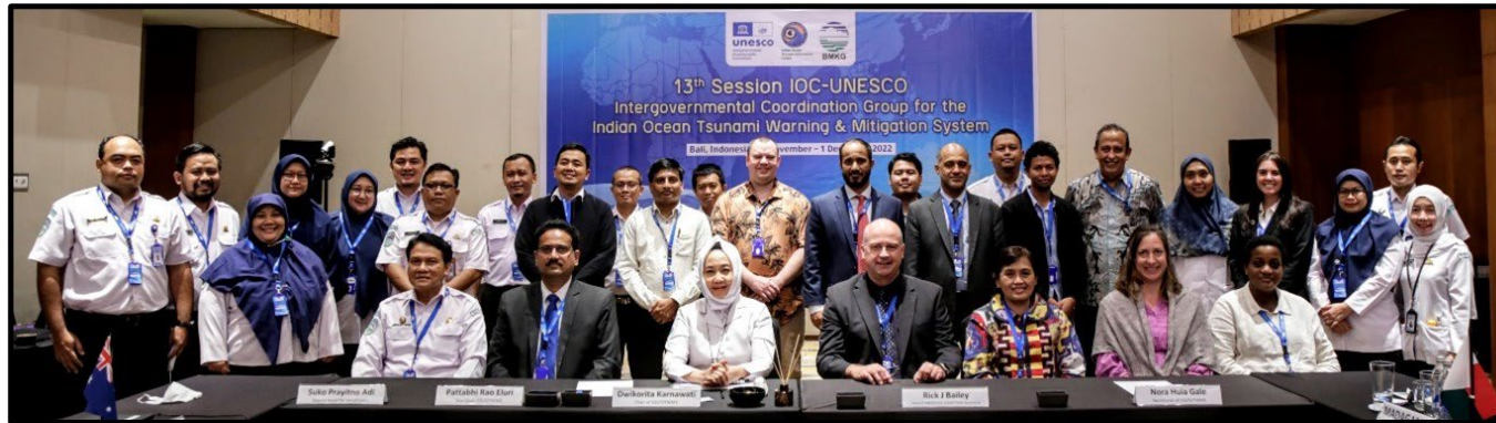
13 th Session IOC-UNESCO Intergovernmental Coordination Group for the Indian Ocean Tsunami Warning and Mitigation System, Bali, 28 November to 1 December 2022

ICG/IOTWMS Intersessional Meeting of Working Group 3 on Tsunami Ready Implementation, 21 August 2024