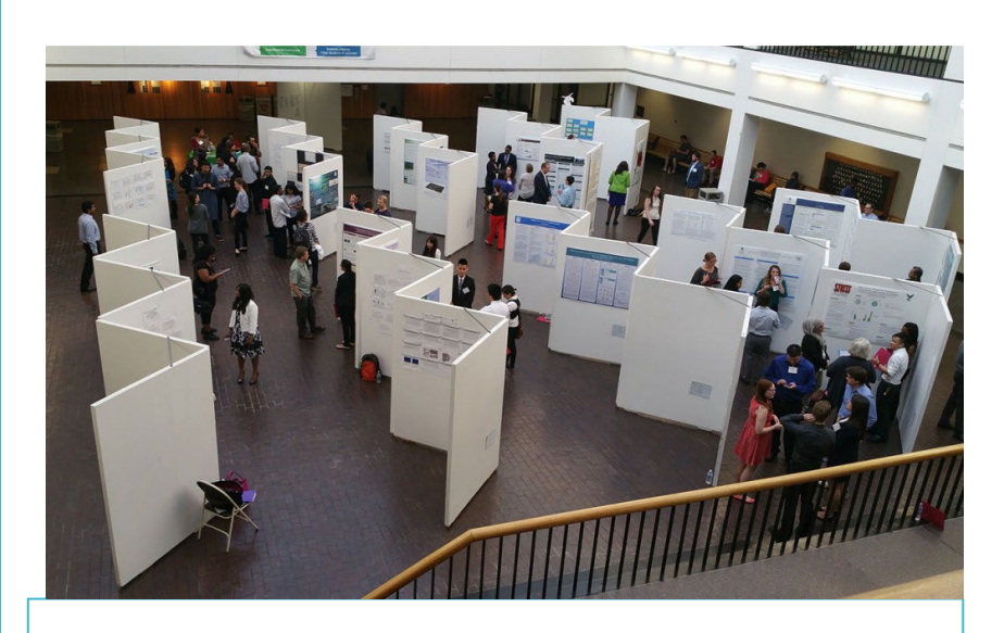
3. Poster Session: open to public to participate for Global Tsunami Symposium