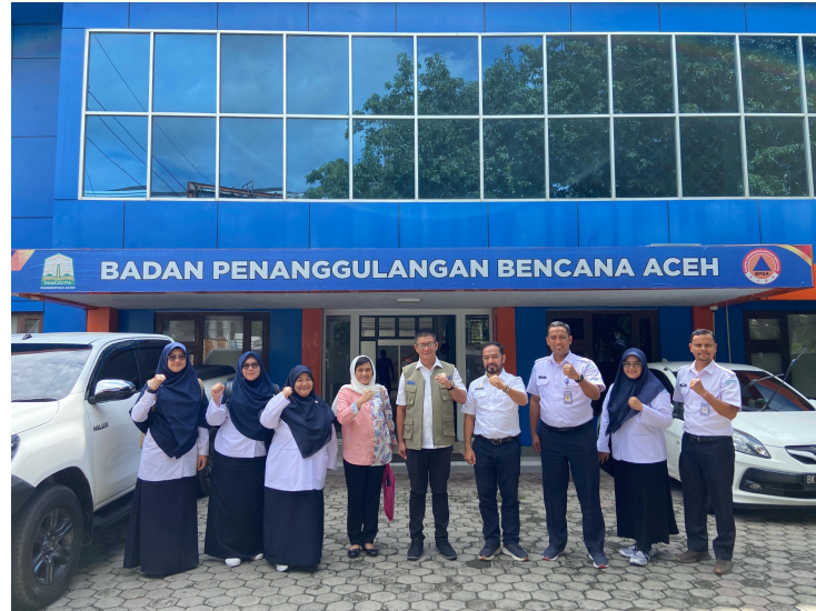
Courtesy to Vice Rector of USK and TDRMC