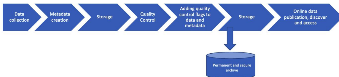
Figure 2: Data flow diagram for delayed-mode data

It is worth mentioning that specific IOC programmes or projects may have specific data flow arrangements as well, including specific outputs (data/information products and services).