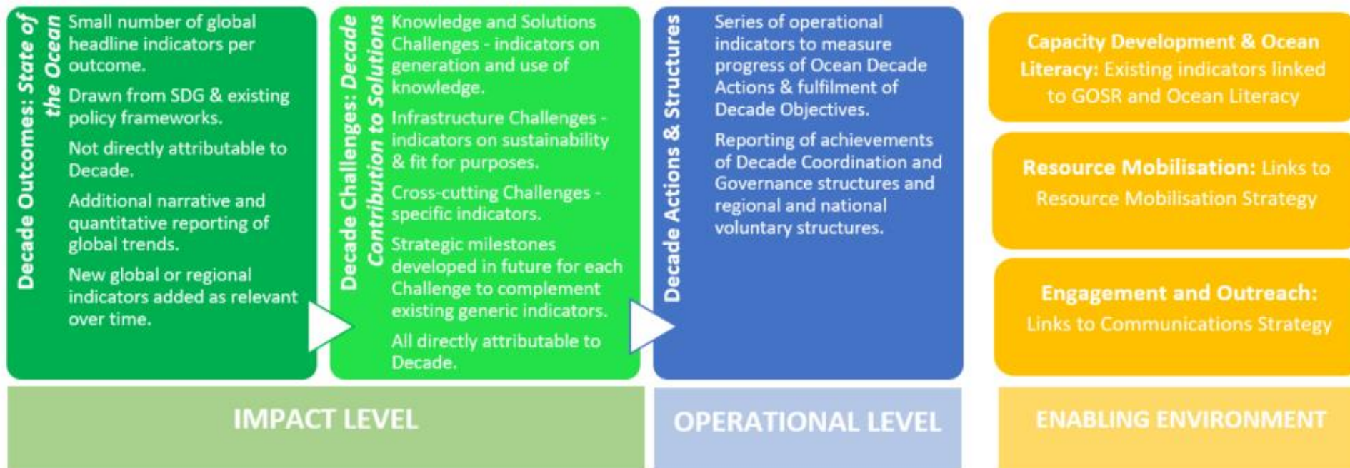
Figure 3: Ocean Decade Monitoring and Evaluation Conceptual Framework