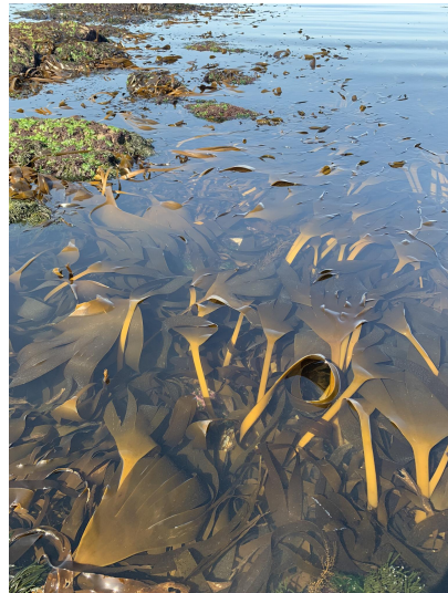
Macroalgal beds (Image by: Isabel Sousa-Pinto)