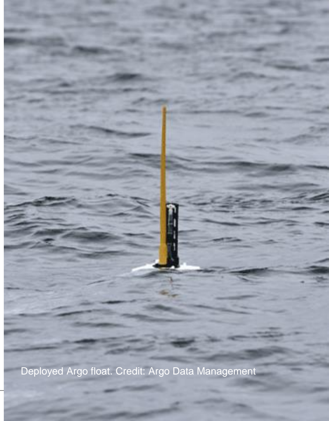
Deployed Argo float.