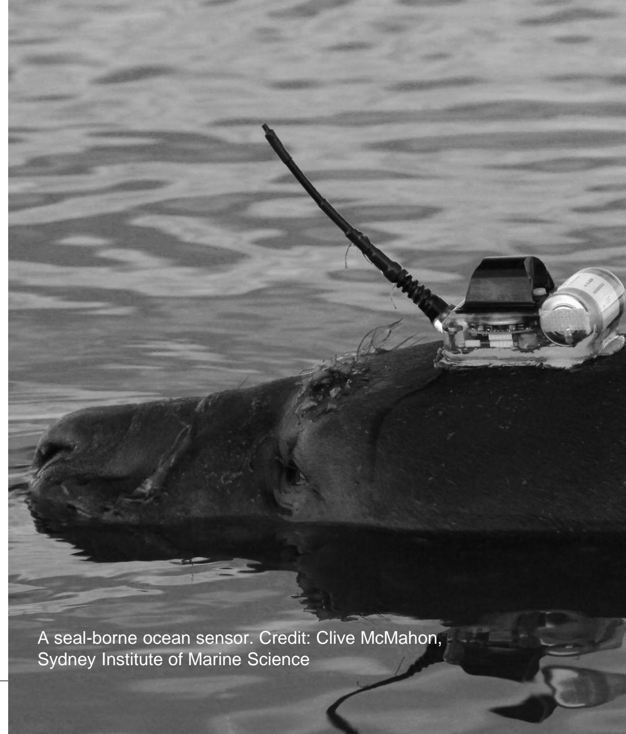
A seal-borne ocean sensor.