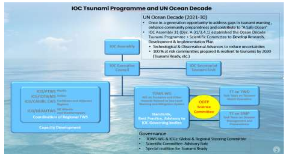
Figure 1: UN Ocean Decade Tsunami Programme Scientific Committee

He introduced the appointed members of the UN Ocean Decade Tsunami Programme Scientific Committee (Annex to Dec. A-31/3.4.1). Members will serve for a period of two years and would be eligible for renewal once.