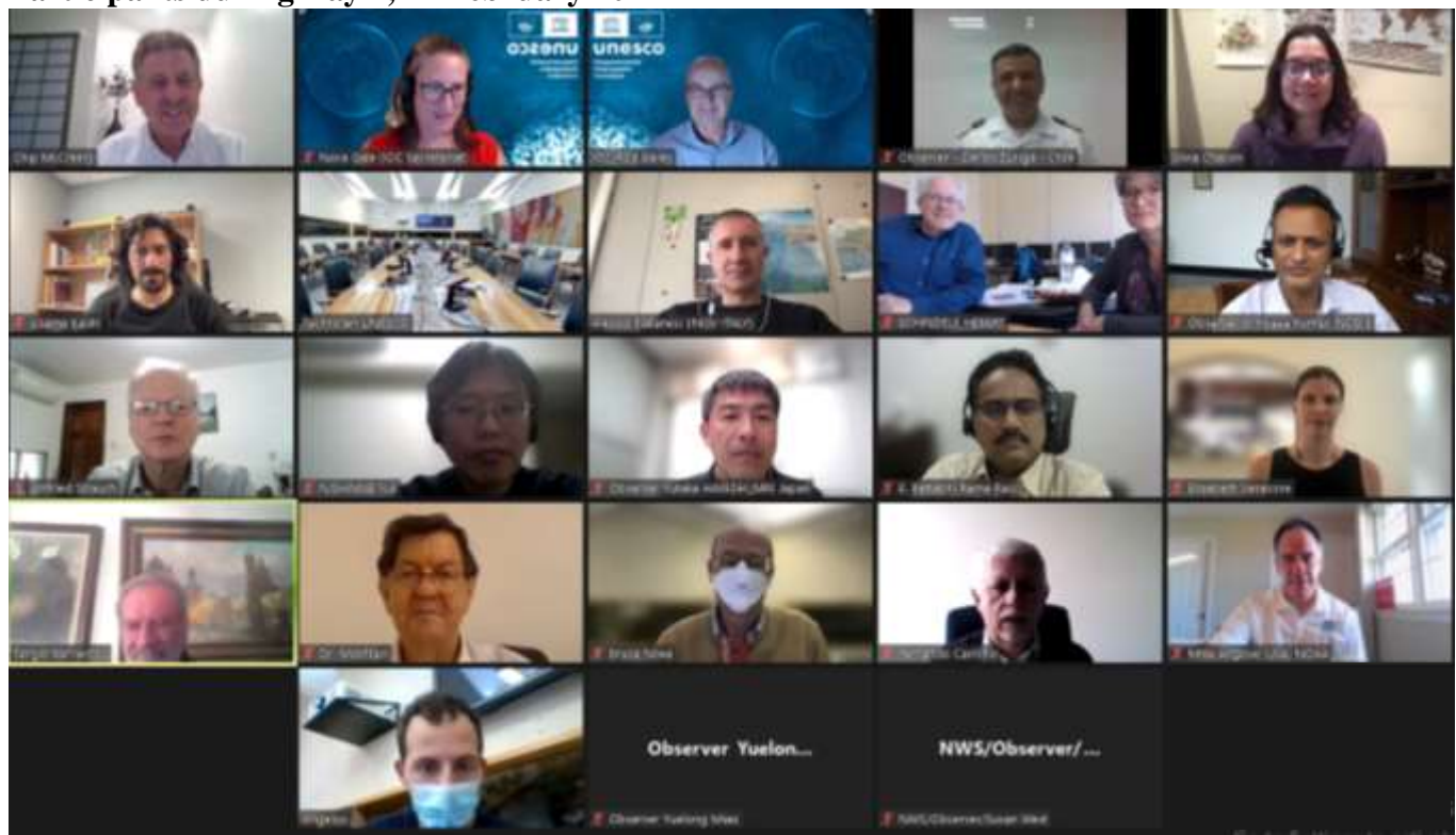
Participants during Day 2, 22 February 2022

Participants during Day 1, 21 February 2022