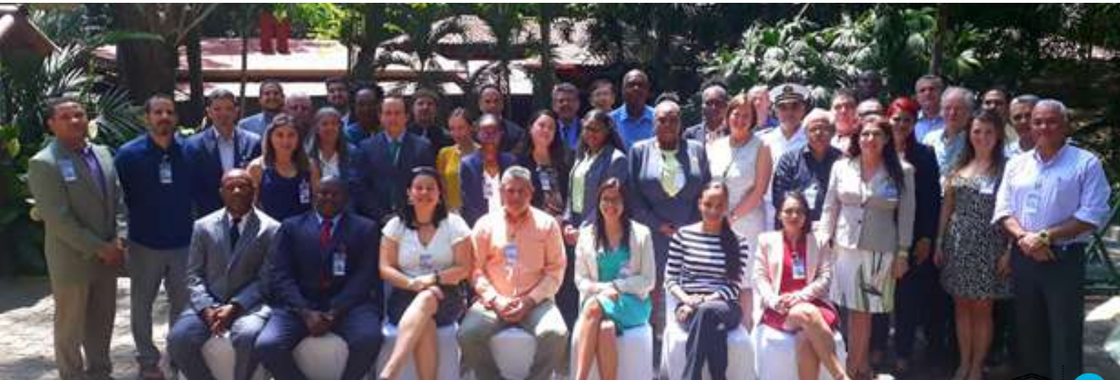
Caption: ICG/CARIBE-EWS XIV, Punta Leona, Costa Rica, 8–11 April 2019