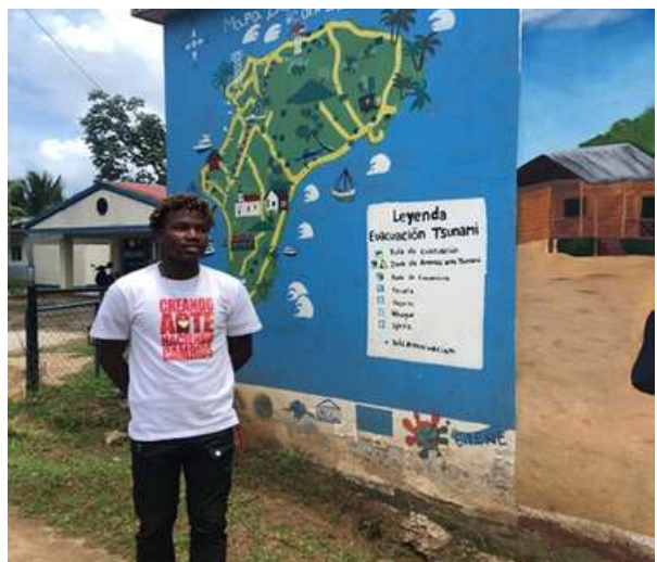
Young Artist standing in front of his mural of the Tsunami Evacuation Map, Corn Island, Nicaragua

Corn Island, Nicaragua has approximately 9,355 inhabitants composed of various cultural and ethnic groups. Nicaragua is home to 19 active volcanoes. Developments (homes, commerce and fishing plants) on Corn Island have been established near the coast at sea level, thus increasing the vulnerability of about 80% of the population and infrastructure to tsunamis. Corn Island was recognized as Tsunami Ready in September 2019 through a European Commission Humanitarian Aid Department's Disaster Preparedness Programme (DIPECHO) funded initiative led by UNESCO/IOC together with national and municipal authorities. The process focused on creating awareness throughout the community, notably through the integration of key sectors and stakeholders (regional and local authorities, education, religious and community leaders, youth and commerce). In the words of Corn Island Mayor, Cleaveland Webster Terry: "the Tsunami Ready project benefited the entire population and visitors. It created consciousness, gives knowledge, and prepares us to create safety measure to face a natural risk of this magnitude."