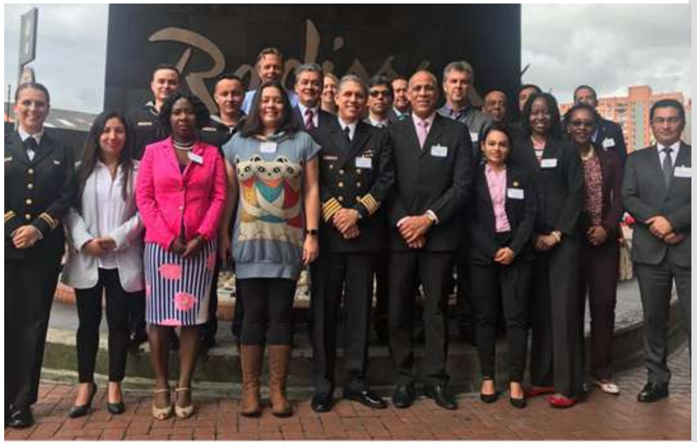
ICG/CARIBE –EWS Group of Experts on Other Coastal Hazards Meeting Bogotá, Colombia, 28-30 November 2018

ICG/CARIBE-EWS Group of Experts on Other Coastal Hazards, supporting the Ocean Decade Safe Ocean Outcome Protecting Life and Livelihoods from Ocean-Related Hazards