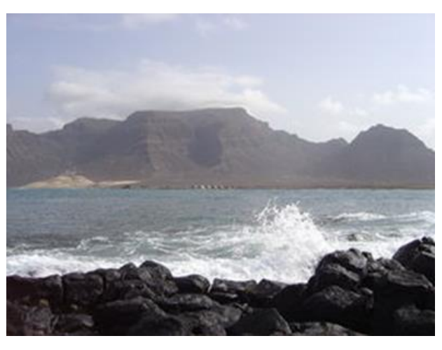
Monte Verde Mountain 750 m high, with a view to neighboring islands