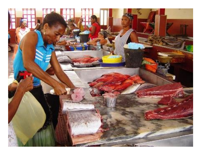
Mindelo Fish Market Fresh fish every day, with a jetty right behind the market where fishermen unload their daily